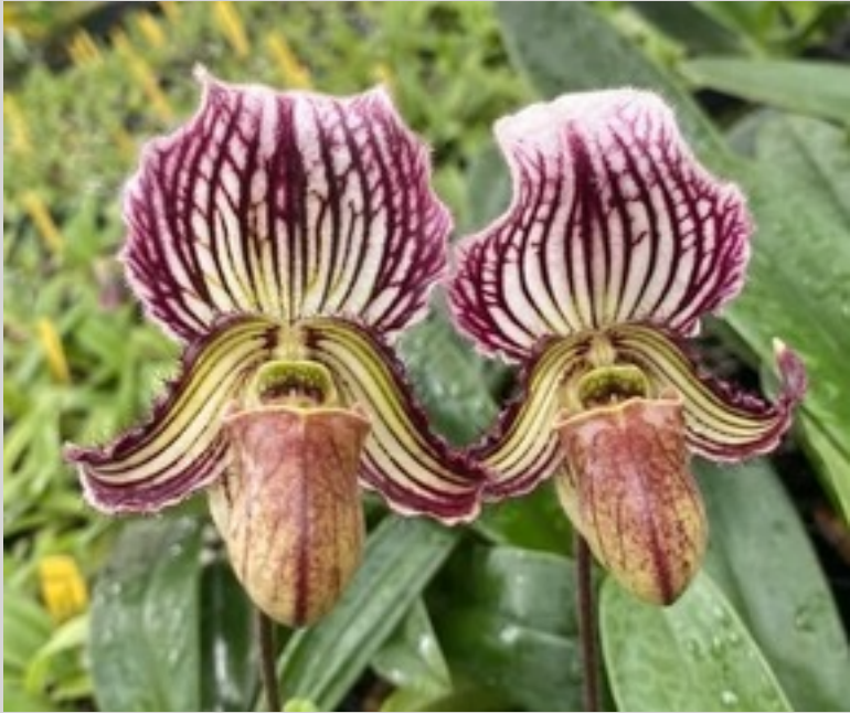
Paph. fairrie anum