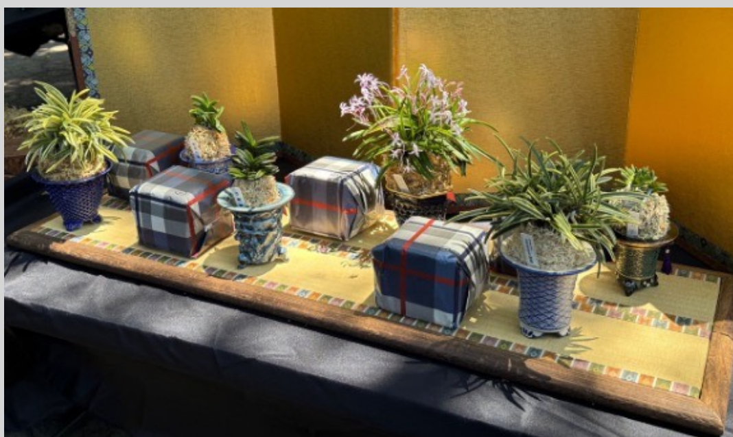
Top 5 Award Winners with trophies.