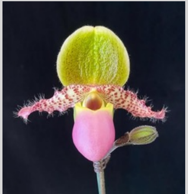
Paph. Mr Whiskers 'Jethro'