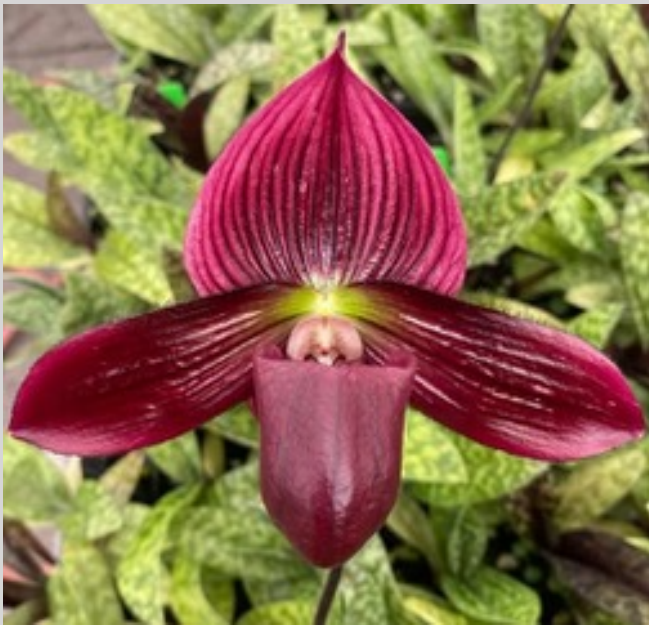
Paph. Vitner's Delight